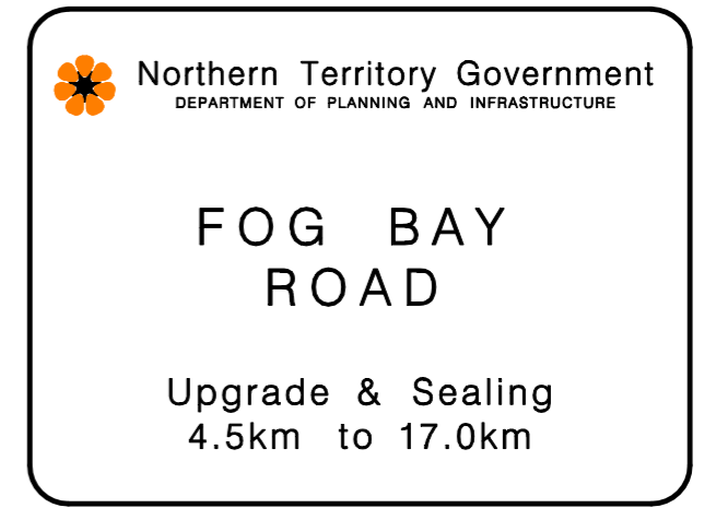
EXAMPLE NOT TO SCALE