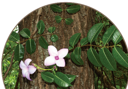
Ornamental rubber vine