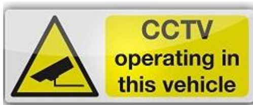
Diagram 1 - Onboard Camera System Sign