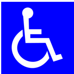
Diagram 5 – International Symbol for Accessibility