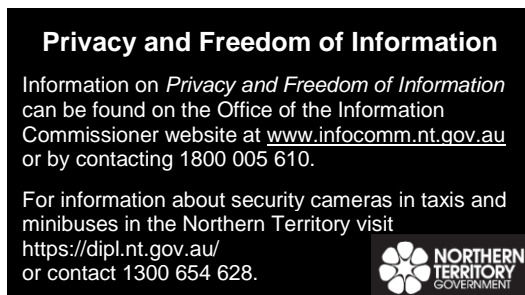
Diagram 2 - Privacy and Freedom of Information Sign